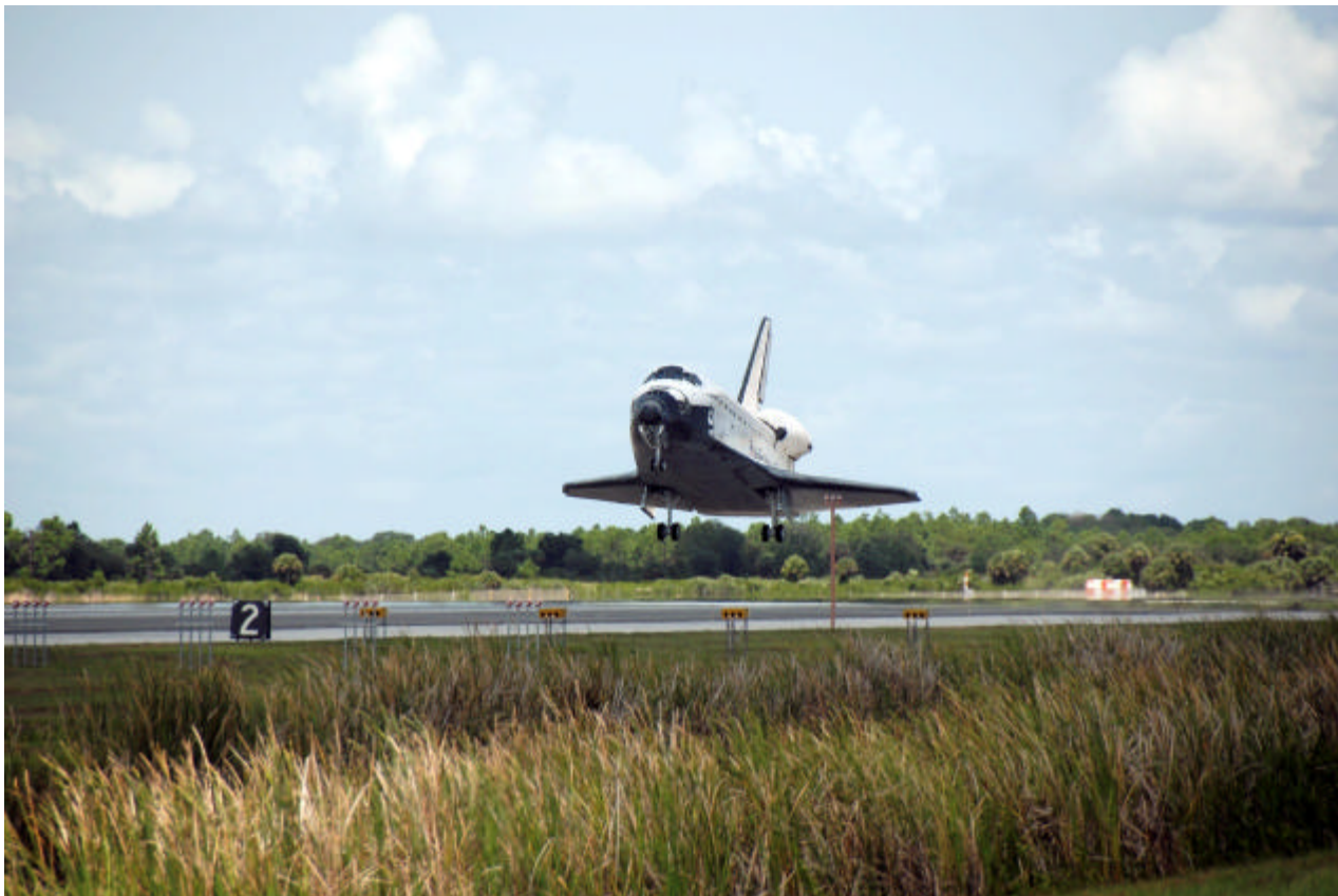
Shuttle Endeavour approaches touchdown at Kennedy Space Center, completing STS-118.

We made contact with the dissidents and found that