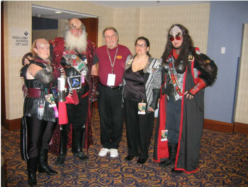
JR and a few friendly Klingons

To the meal add 1/4 whole wheat pita or 1 small apple.