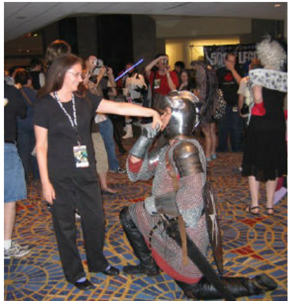
Spring and a knight she encountered

To the meal add 1/4 whole wheat pita or 1 small apple.